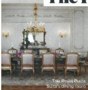
The Royal Plaza Suite's dining room